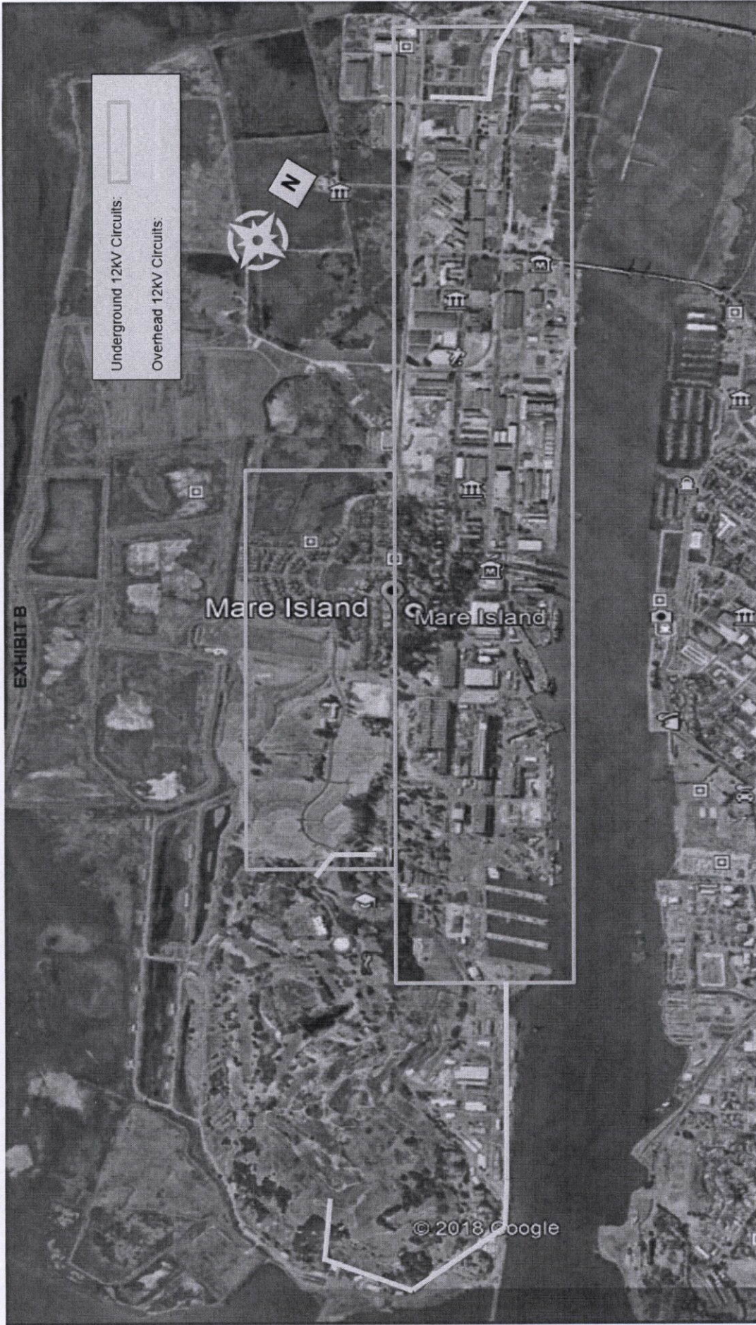
EXHIBIT A: Island Energy Service Territory